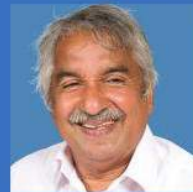
Sri. Oommen Chandy