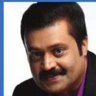
Sri. Suresh Gopi