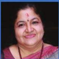
K. S. Chitra