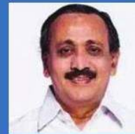
Sri. M. K. Raghavan