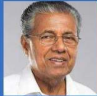
Sri. Pinarayi Vijayan