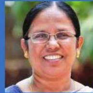
Smt. K.K Shylaja Teacher