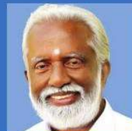
Sri. Kummanam Rajasekharan