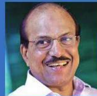
Sri. P. K. Kunhalikutty